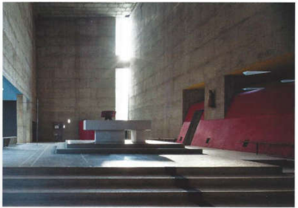
Above left: a trademark 'light cannon' illuminates a little altar, whose cross and candlestick were designed by the architect. Above right: the sacristy lies behind an oblique red wall, to the right of the dominant main altar