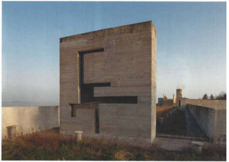
Above left: Iannis Xenakis, a musician and Le Corbusier's assistant, designed the undulating glass surfaces. Above right: to light this stairwell, a design resembling the blade of a key was cut into the reinforced concrete