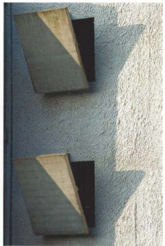
Above left: the pebble-encrusted loggia with its fretwork is identical to those at the Unité d'Habitation, Nantes, begun in the same year. Above right: shields deliberately block off views at the end of the cell corridors.