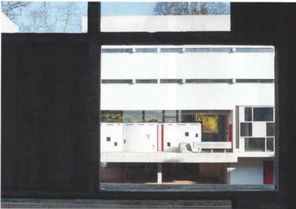
Below left: beside a Mondrian-esque bay of glass and concrete quadrilaterals, three convex walls screen the conciergerie. Below right: the human need for colour, said Le Corbusier, was as fundamental as 'water and fire'