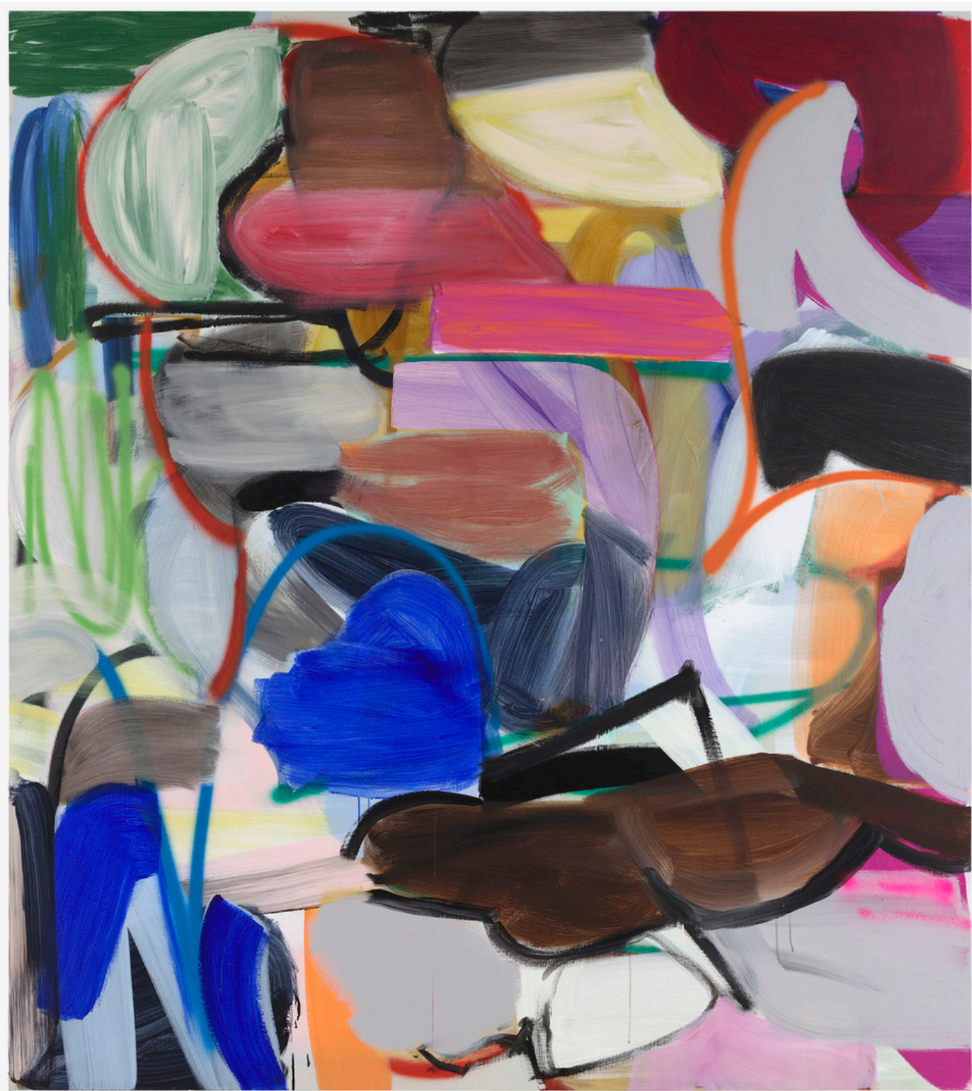
Liliane Tomasko Shapeshifter (playing with ideas of solidity) , 2024 Acrylic and acrylic spray on linen 228.6 × 203.2 cm